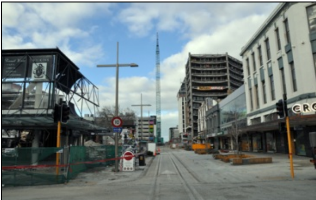
Rebuilding Christchurch's Central Business District.