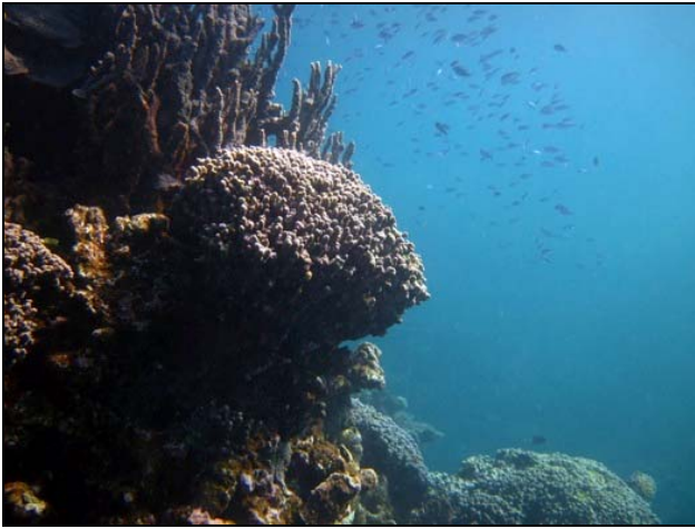
Patch reef, Ningaloo Reef, Coral Bay, WA.