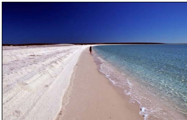
One of our favourite beaches, Shell Beach, WA.