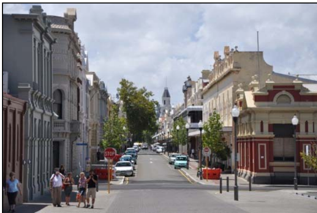
Our street in Fremantle, WA.