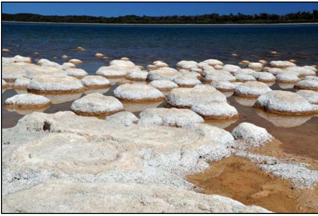
Thrombolites, Lake Thetis, WA.