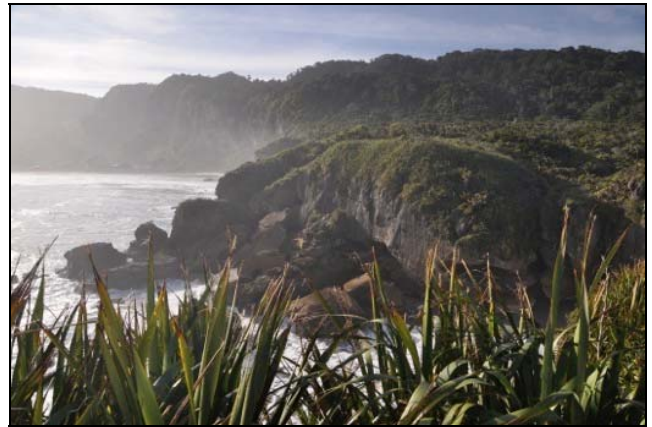
Coastal South Island, NZ.

The Pufahl family also visited the Southern Alps where the highlight was a day hiking on the Fox Glacier. They were thrilled to see many of the geomorphological features for which New Zealand is famous.