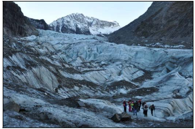
Hiking the Fox Glacier, South Island, NZ.